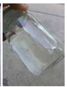
Hydro Pig no 1